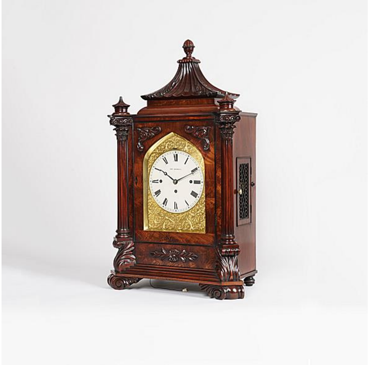
A LATE GEORGIAN MUSICAL TABLE CLOCK

XVIII-XIX CENTURY FURNITURE & DECORATIVE ARTS