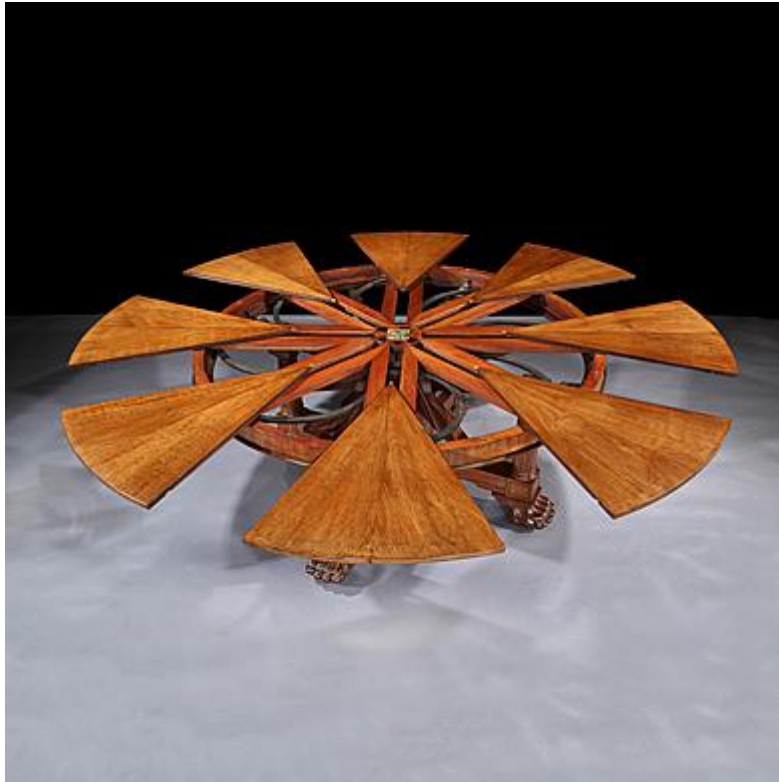
A Very Rare 'Jupe's' Extensible Mechanical Action Circular Dining Table By Maple & Co

XVIII-XIX CENTURY FURNITURE & DECORATIVE ARTS