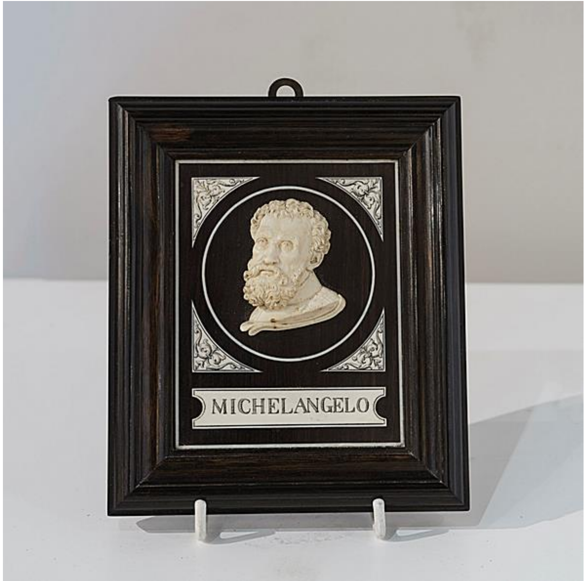
A MINIATURE CARVED IVORY BUST OF MICHELANGELO BY GIOVANNI BATTISTA GATTI

XVIII-XIX CENTURY FURNITURE & DECORATIVE ARTS