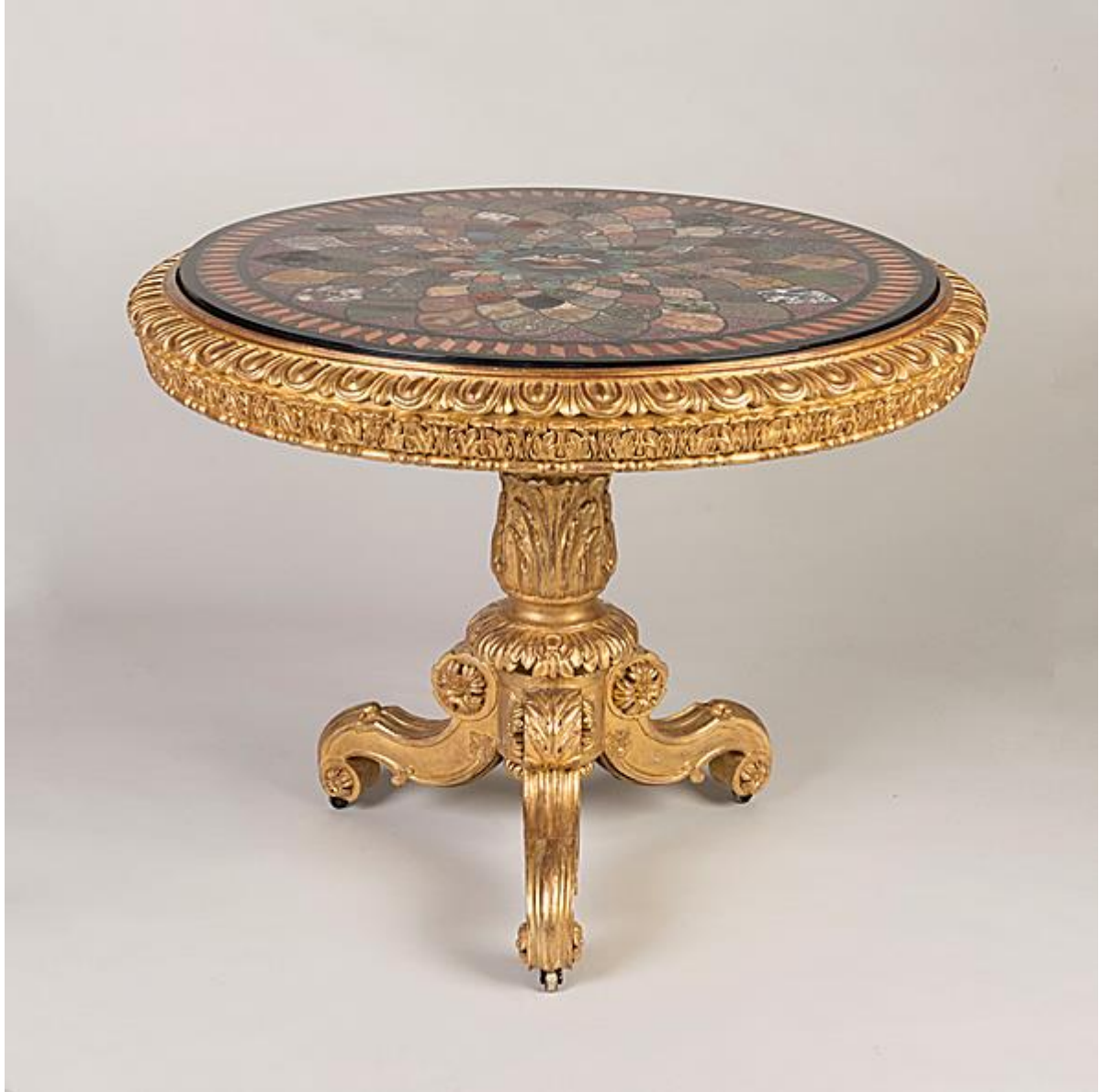
A SUPERB SPECIMEN MARBLE CENTRE TABLE ATTRIBUTED TO CAVAMELLI

XVIII-XIX CENTURY FURNITURE & DECORATIVE ARTS