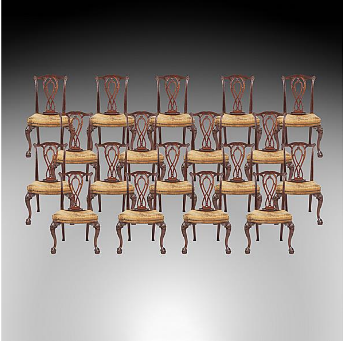
A LONG SET OF EIGHTEEN DINING CHAIRS IN THE EARLY GEORGIAN MANNER

XVIII-XIX CENTURY FURNITURE & DECORATIVE ARTS