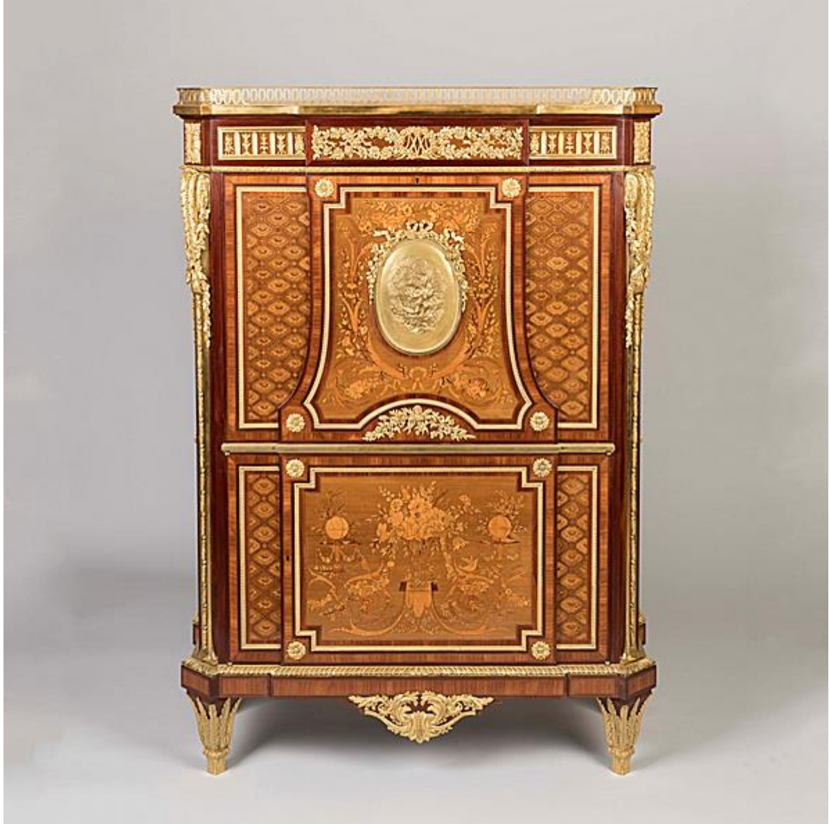
AN EXCEPTIONALLY RARE SECRÉTAIRE À ABATTANT BY PAUL SORMANI OF PARIS

XVIII-XIX CENTURY FURNITURE & DECORATIVE ARTS