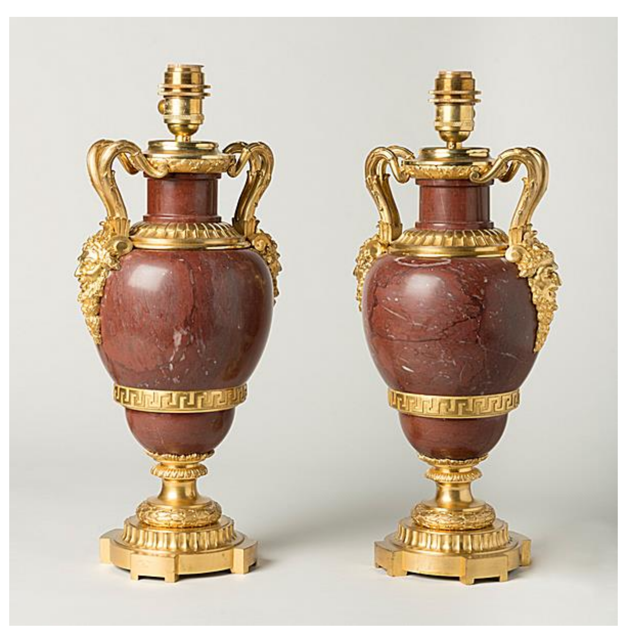
A PAIR OF FRENCH ORMOLU-MOUNTED RED MARBLE LAMPS

XVIII-XIX CENTURY FURNITURE & DECORATIVE ARTS