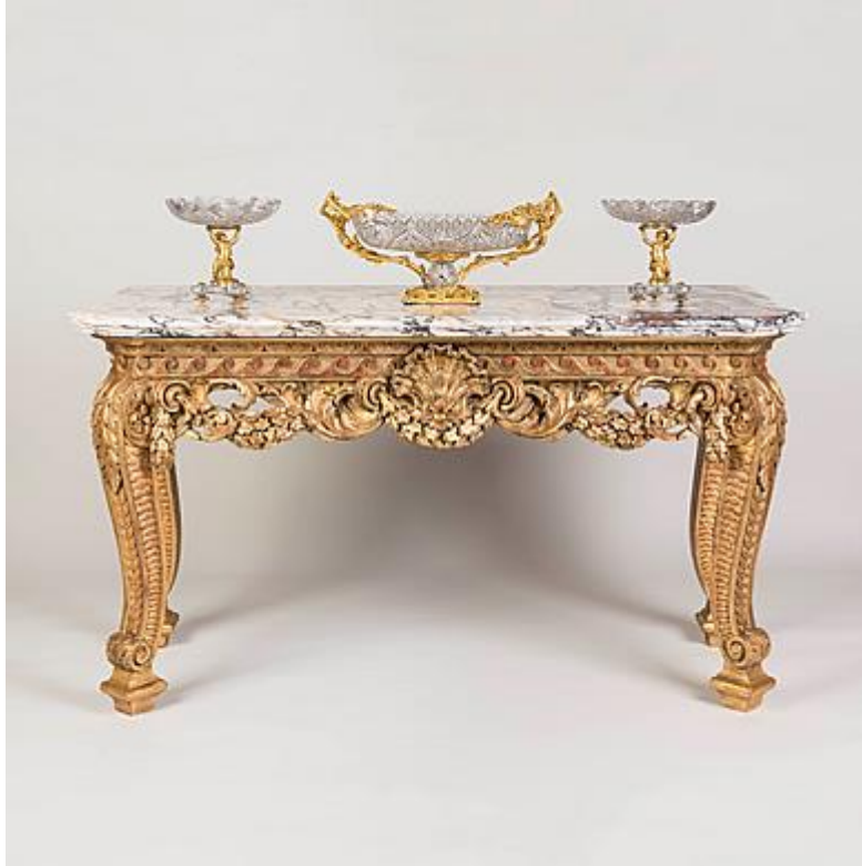
A Magnificent Console Table After the Design of William Kent

XVIII-XIX CENTURY FURNITURE & DECORATIVE ARTS