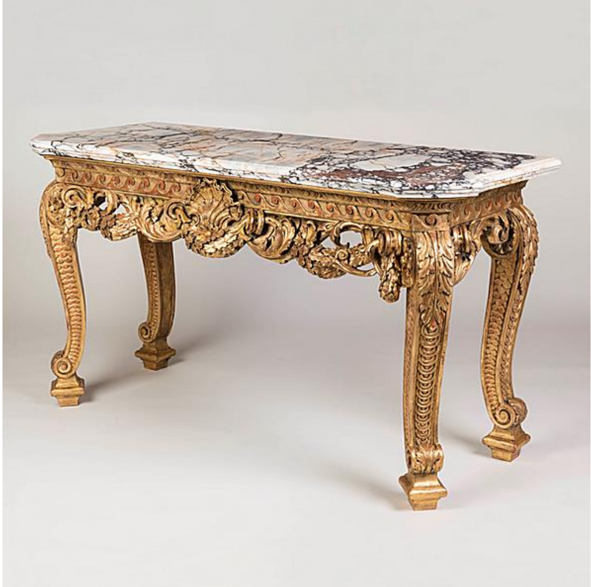
A MAGNIFICENT CONSOLE TABLE AFTER THE DESIGN OF WILLIAM KENT

XVIII-XIX CENTURY FURNITURE & DECORATIVE ARTS